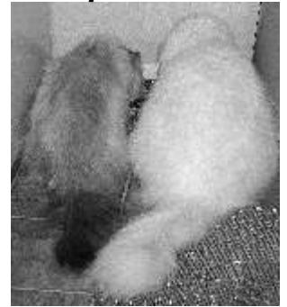
Ella and Boo share a meal.

We love our senior cats. Many of them have been with us for years and seem to be quite happy here. We know we're providing them with a place where they can live out their lives in relative peace, and that's important to us. We also know that senior cats require special care that not everyone can give. Still, the reasons that may prevent someone from adopting an older kitty are the very reasons that an older kitty benefits from being in a home of his own. While our cage-free cattery offers a pleasant environment for cats, it makes it very difficult for us to know whether a particular kitty is not eating or drinking enough--sure signs of illness. Many medical conditions that are common in older cats are more easily treated or managed when they're caught early. It's much easier for a caring person with one or two cats to notice early signs of illness.