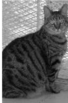
Simona-- big & beautiful