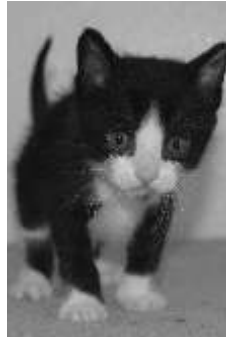
"H" litter-- Almost ready