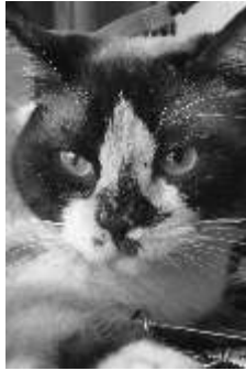
Zipper-- Queen of Everything