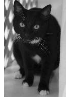
Blister-- wanted in 7 states