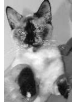
Birdie-- Carol E's favorite

Adoption Center Street Address: 133 North D Street Lompoc, CA 93436